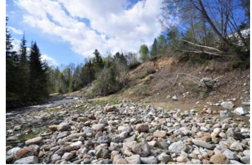
View looking South From toe of embankment

Detour of Traffic: Traffic will be detoured through the project site