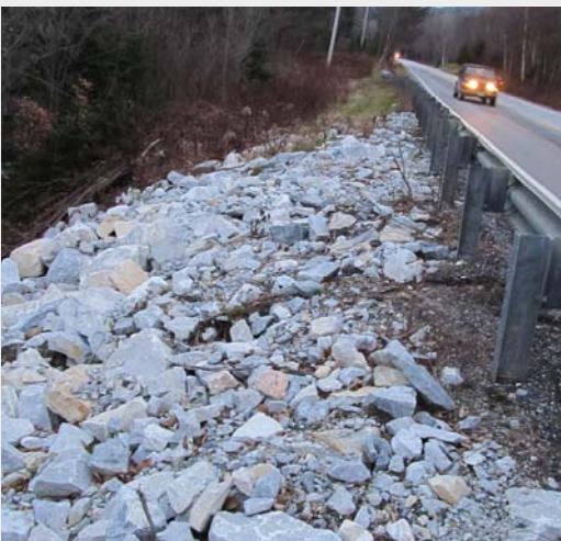
Existing view Looking South

Traffic control is anticipated to be alternating one-lane through the construction site with no closures proposed.