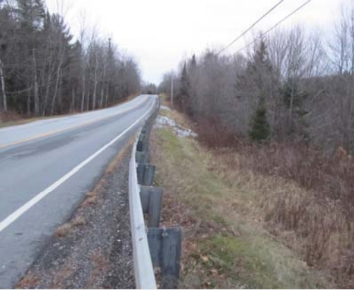
Existing view Looking North