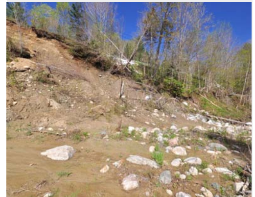
View looking North From toe of embankment